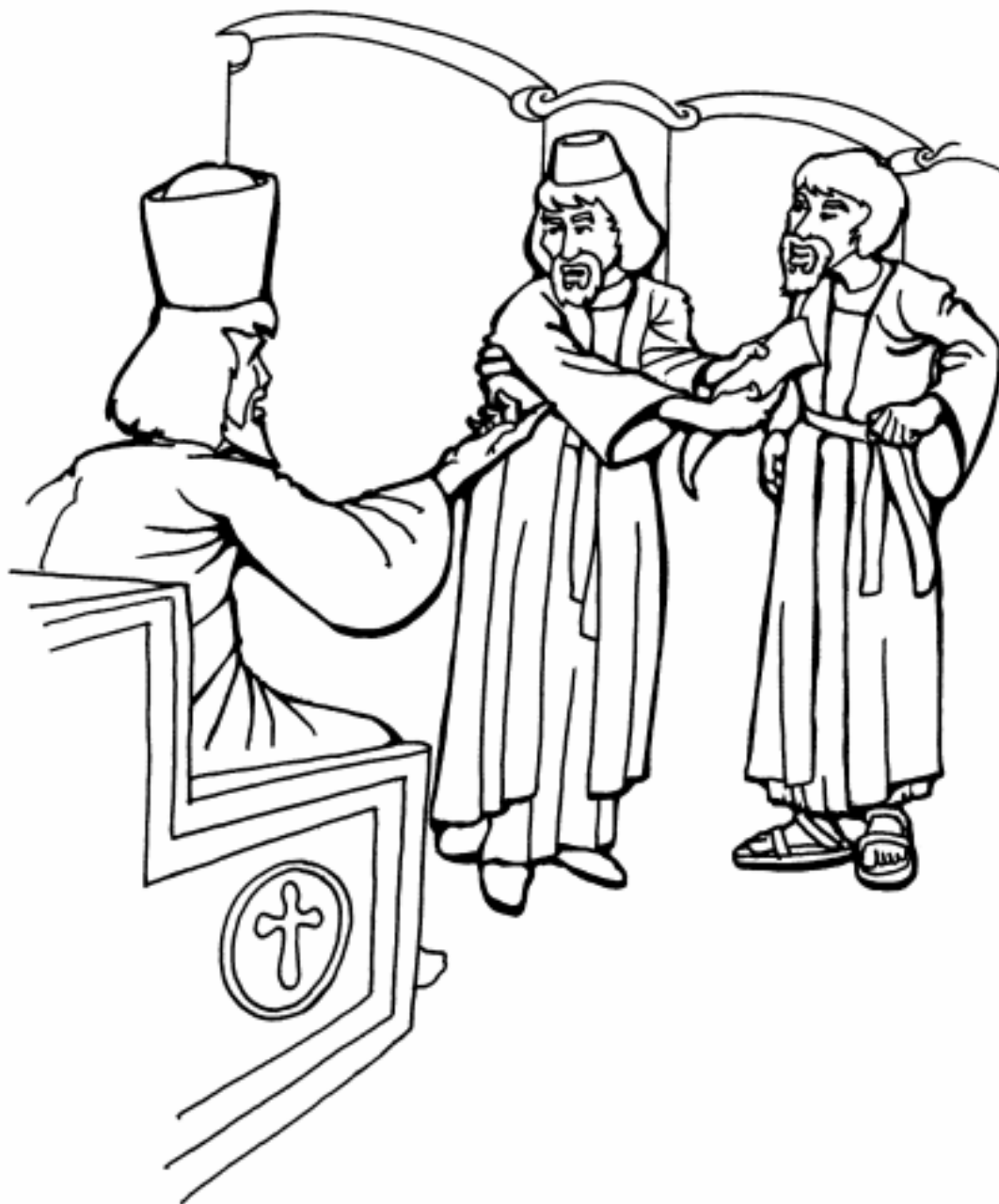
"Paul is sent to Felix." Acts 23:23-24:27